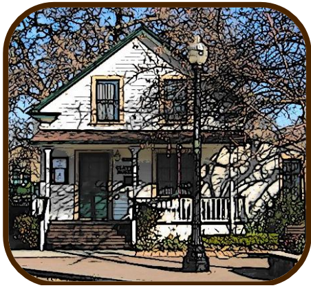
6101 Main Street